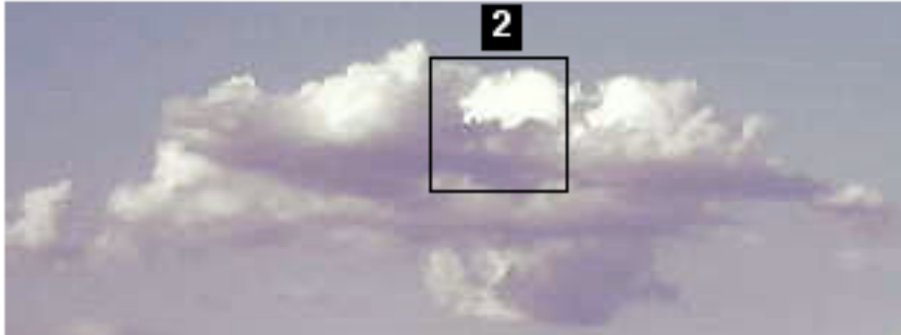
Feature 2:

In the left center of the i.d. window can be seen a double row of dark squares. These could be viewing ports, or maybe vents.