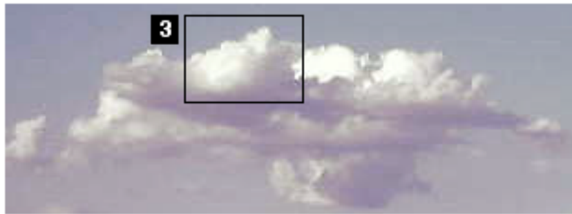
Feature 3: © copyright applies.

In the left center of the i.d. window can be seen a double row of dark squares. These could be viewing ports, or maybe vents.