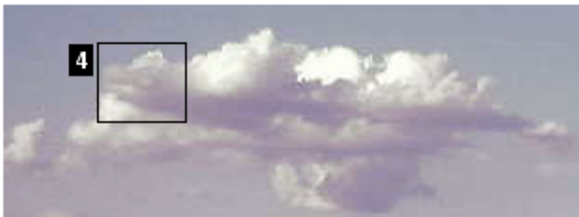
Feature 4: © copyright applies.

The feature in i.d. window 3 appears to be similar to an Earth type building. There are four tiers centered by a dome.