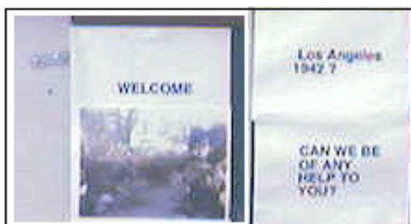
Our Written Response Posted on Pumphouse