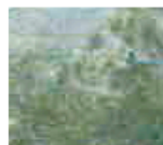
More ETs in flying chair SECTION LIGHTENED