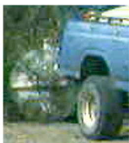
Transparent vehicle Look in the bubble