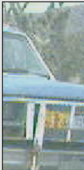
Alien 7 feet tall