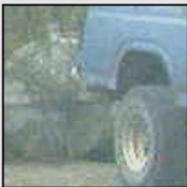
Transparent Bubble Vehicle