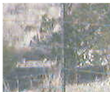
ET with equipment