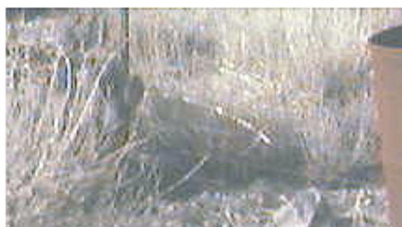
Riccant with receiving dish