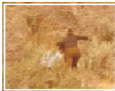
Six Ripples in Hologram